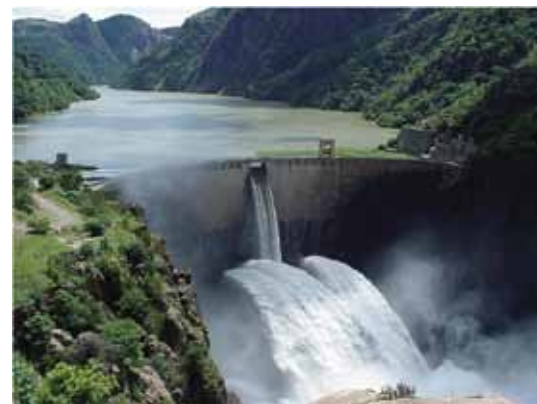
Cahora Bassa Dam in Mozambique regulates Zambezi waters for hydropower production. Our research demonstrated that the value of sharing waters between upstream and downstream users outweighs the value of the water being used solely for hydropower production.