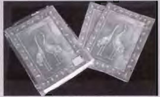
Crane Christmas Cards

your Christmas cards or do your shopping without leaving home—all while helping endangered birds and wetlands. You can kill two birds with one stone, oops bad bird pun.