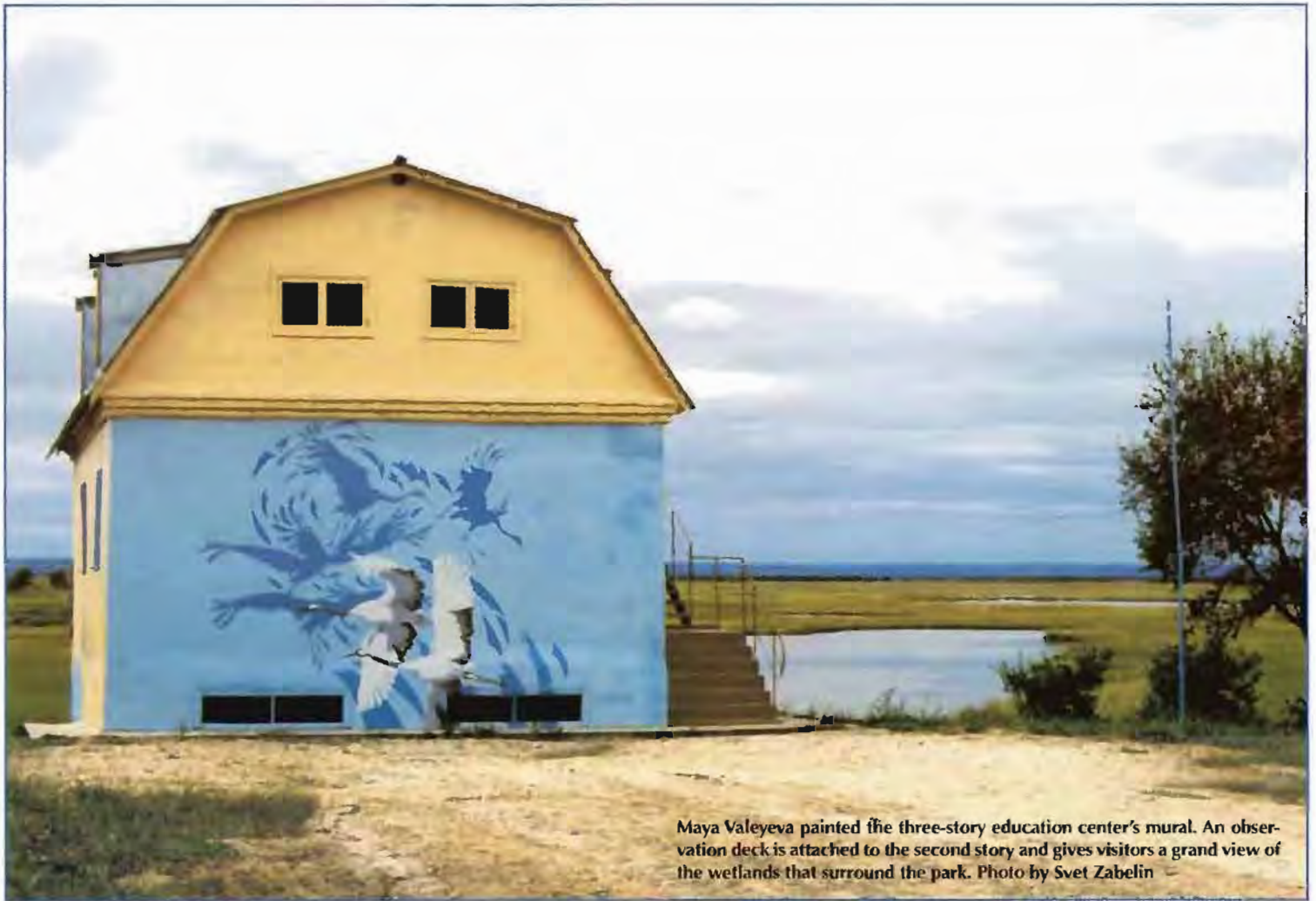
Maya Valeyeva painted the three-story education center's mural. An observation deck is attached to the second story and gives visitors a grand view of the wetlands that surround the park.