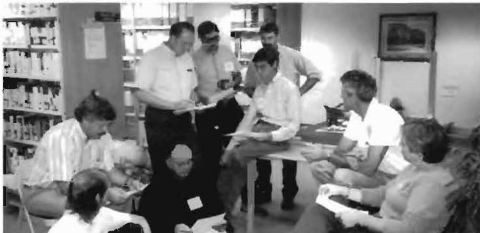
Gathered in the stacks of the Ron Sauey Memorial library, Canadian and US members of the Whooping Crane Recovery Team finalize their historic recommendation to release Whooping Cranes in Wisconsin.

The four refuges are located north and west of the city of Necedah. For more information about Necedah, please call 608-565-2551, and for Sandhill, call 715-884-2437. ♡