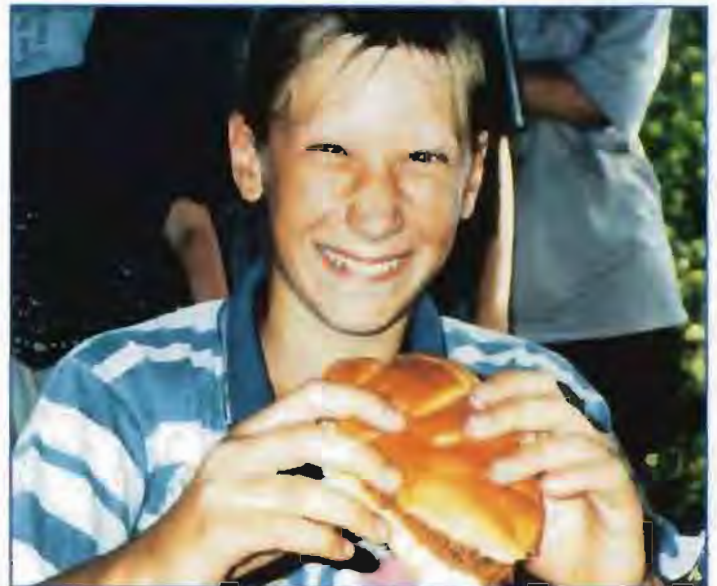
Campers and teachers were thrilled to celebrate the Fourth of July with us. We offered to cook for all of them. Having planned and prepared most of the meal in America, we proudly served sloppy joes, baked beans, artichoke dip, cranberry bread, chocolate chip cookies, and s'mores. This camper tries his first sloppy joe!