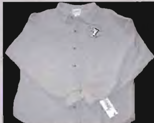
Shirt with ICF Logo