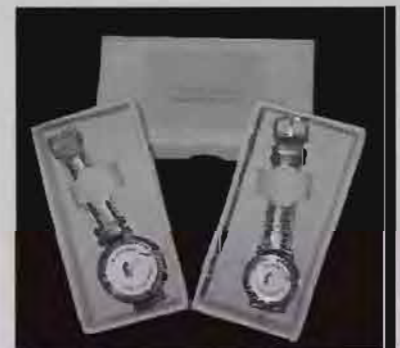
Men's and Women's watches

The Ron Sauey Memorial Library's portion of the website has been newly re-designed.