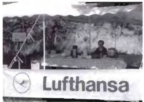
Lufthansa, ICF's official airline, brightened up the hospitality tent where members were able to relax and mingle.

ICF staff thanks all of its members who made possible yet another successful Annual Meeting. ~✿