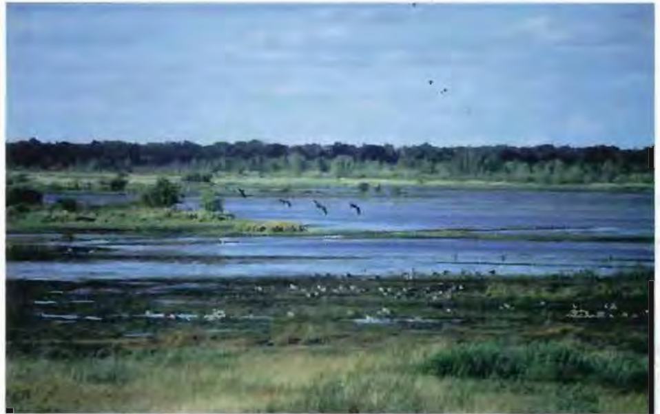
The view from the tower at Necedah: in central Wisconsin, over 100,000 acres of wetland and surrounding forest have been protected. For 60 years, wildlife and the landscape they inhabit have been recovering from logging, overhunting, drainage, and finally farming that failed in the 1930s. Return of the Whooping Crane would be another important step in that recovery.

The Whooping Crane almost disappeared from North America because the tall, white bird could not adapt to changes overtaking the prairies and wetlands of the continent. The Sandhill Crane did adapt,