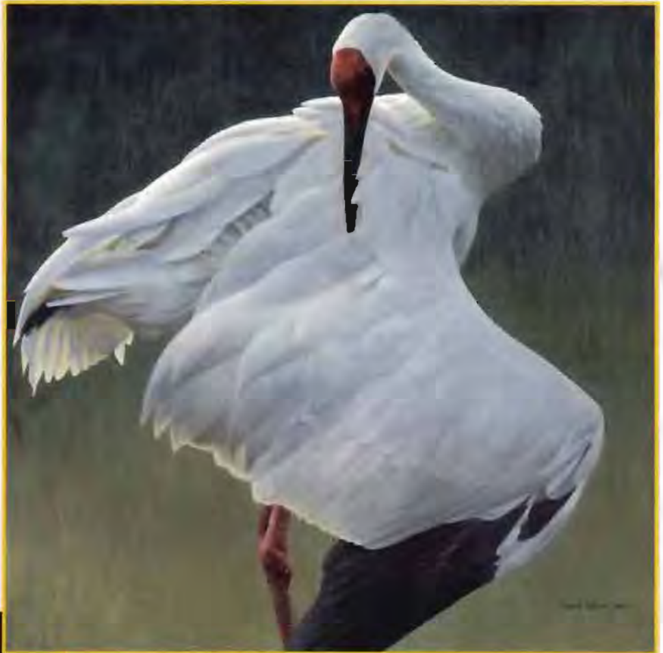
"Siberian Crane," painted by Robert Bateman for the conservation of Siberian Cranes.

ICF considers the Siberian Crane (Sibe) to be the most endangered of cranes. During their migration across Asia, the Sibes visit 12 nations. Hunting and loss of wetlands threaten these most aquatic of cranes. Widespread education is needed to sharpen public awareness and conservation action. To help, Robert Bateman created this magnificent painting of an open wing back threat of a male Sibe. Thousands of posters will be made and distributed along the Asian flyways. The original painting "Siberian Crane," (36" X 36", acrylic on canvas) is for sale on a first come, first served basis at US $50,000. Robert and Birgit Bateman have generously offered to provide the full amount of the sale for the conservation of Siberian Cranes. If the painting is sold through the Bugle, the entire proceeds will be given to ICF. If a gallery or some other agent sells it privately, they will be entitled to 16.6%.