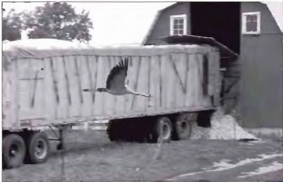
Loose bird? Has this Eurasian Crane escaped? If you know your ICF history, you would know that in 1977 this bird was quite at home. Where was ICF located before Shady Lane Road? Find out in May's 25th Anniversary Bugle!