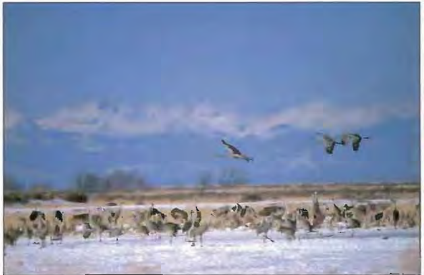
Sandhill Cranes find late spring snow at their mid-day social gathering in southern Colorado. The Sangre de Cristos rise in the background.

These same canals today provide water to both the 11,168 acre Alamosa National Wildlife Refuge (NWR), and the 14,189 acre Monte Vista NWR. The wetlands of the latter are actually artificially created and maintained in order to provide additional and essential habitat. Both offer exceptional opportunities for