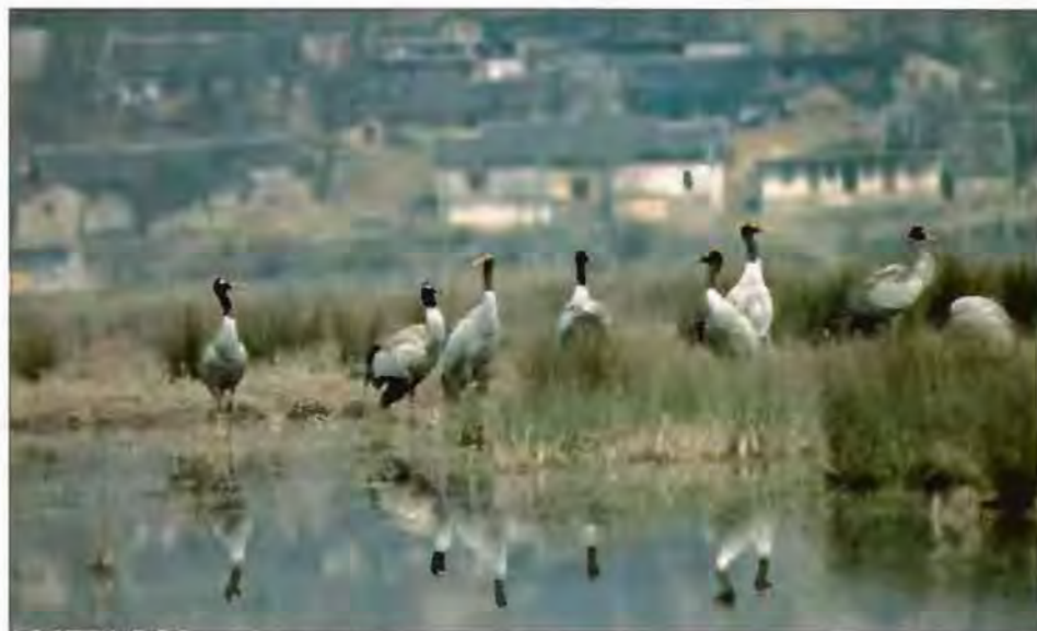
Black-necked Cranes wintering at China's Cao Hai Nature Reserve face many human pressures. A workshop convened at Cao Hai from December 2-7, 1997 to evaluate efforts to integrate conservation with rural development. The Cao Hai project emphasizes farmer participation and leadership.

Our workshop occurred within the four-story headquarters of CNR. By climbing to the top, participants gained a wide view of the mountain lake. Wind ruffled water against ten thousand sedge stems, while waterfowl floated, dove, and foraged in scattered flocks. In 1996, an ICF-CNR team counted over 75,000 waterbirds at Cao Hai.