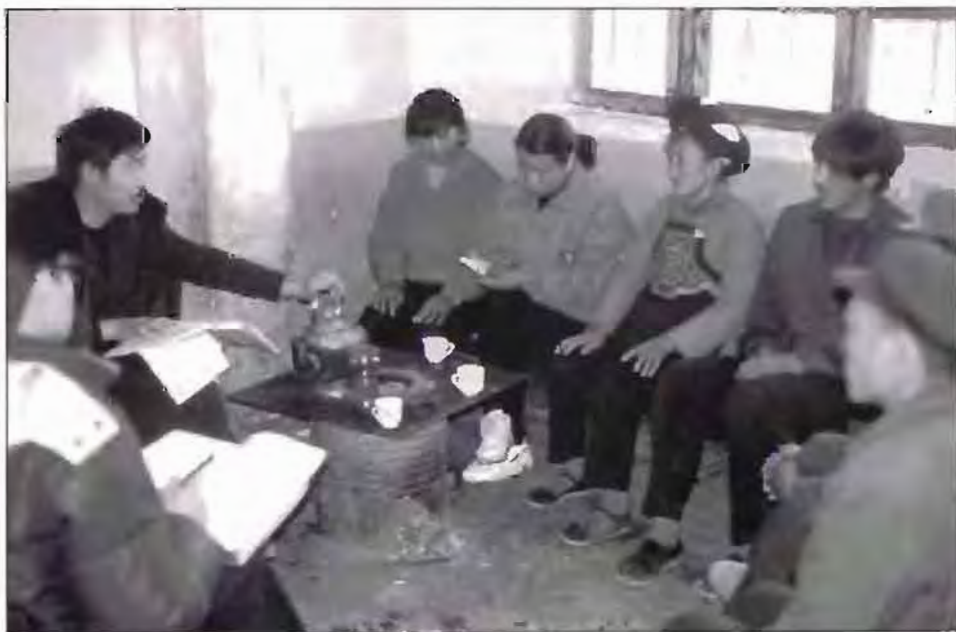
In 1995, staff of the Rural Development Research Center and of Cao Hai Nature Reserve (at left) assisted farmers of Haibian Village in developing the first Community Trust Fund.

Workshop participants did note continuing challenges for CNR. Community involvement is a long-term effort, and our